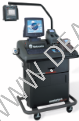
MTS 6100 Workstation